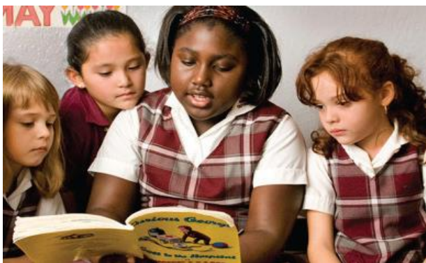
Step Up For Students Income-Based Scholarship Growth