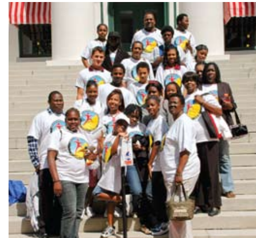
Hundreds of scholarship supporters traveled to Tallahassee from throughout the state for the opportunity to voice their great experience with and need for the Step Up For Students Scholarship Program.